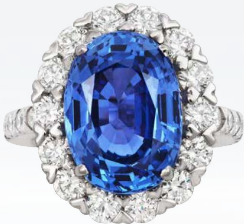
CEYLON BLUE SAPPHIRE