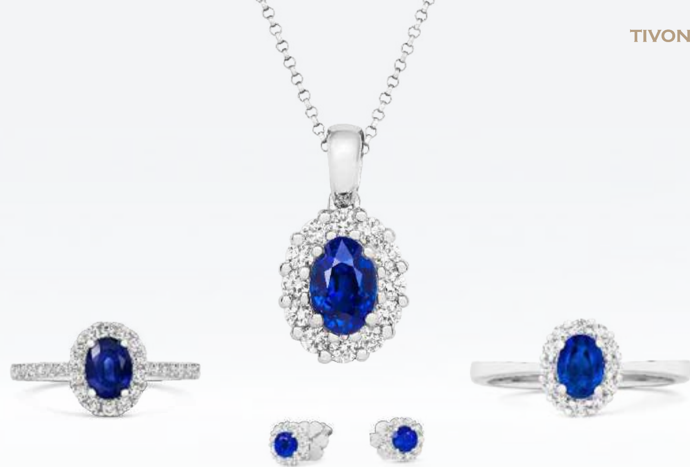
DEEP SEA BLUE SAPPHIRE