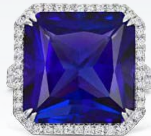
ART-DECO MEETS CONTEMPORARY