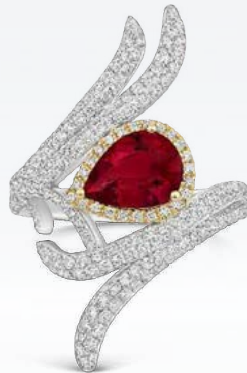
SUPER-FINE -RED RUBY