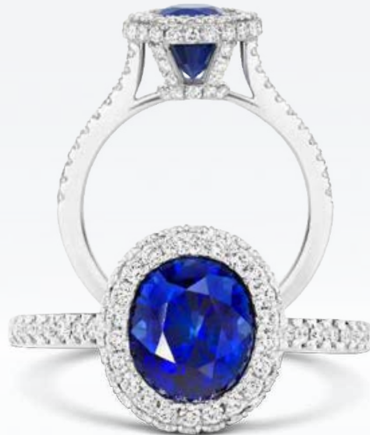
SILKY RICH BLUE SAPPHIRE