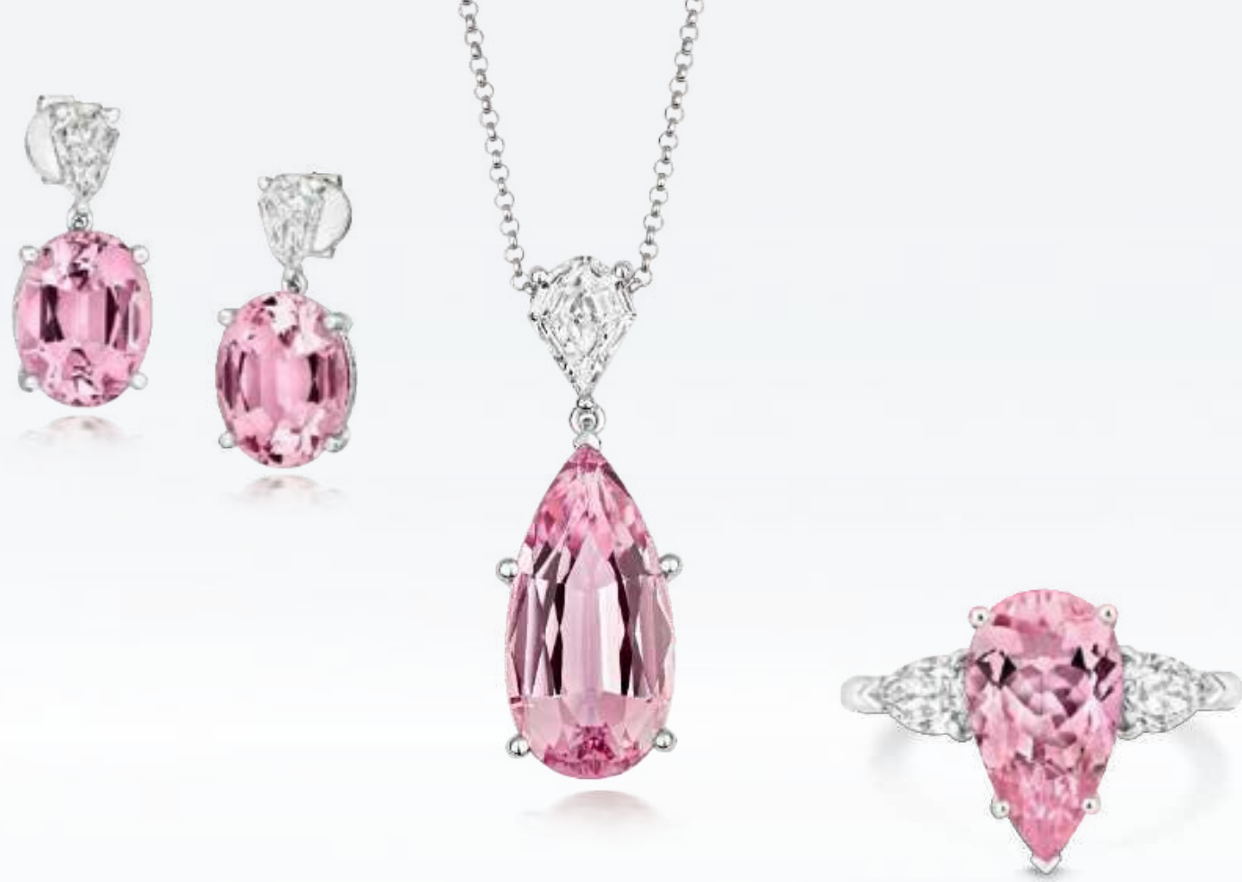
MADAGASCAN PINK MORGANITE