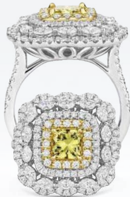
NATURAL FANCY INTENSE YELLOW