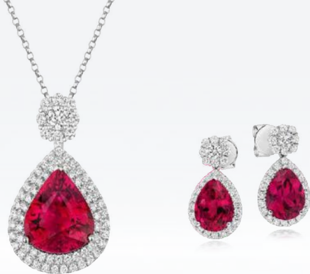
FINE RUBELITE TOURMALINE