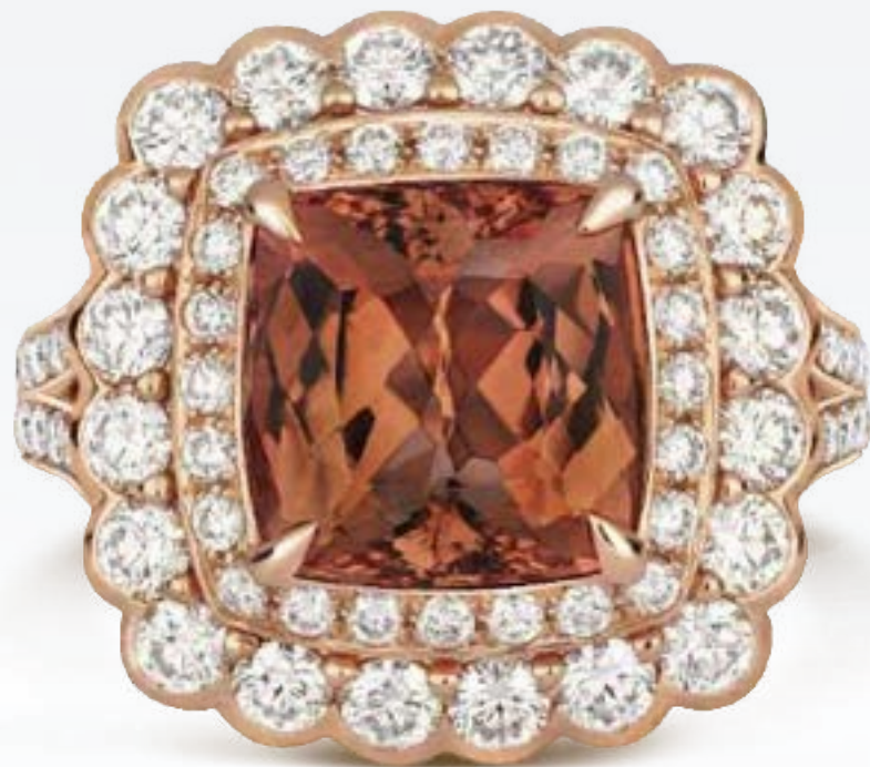
BRAZIL'S FINEST – IMPERIAL TOPAZ

There is a misnomer that all gems are selected, graded & cut in the exact same way. However, there are some things that cannot be gleaned in textbooks. Some secrets only come with experience.