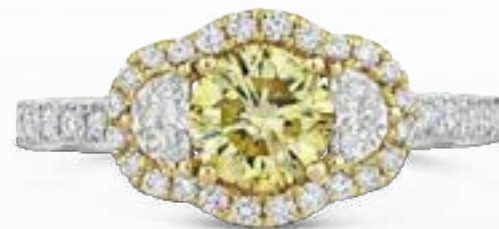
NATURAL FANCY ORANGE YELLOW