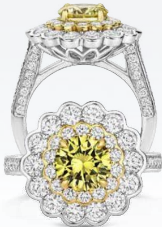
NATURAL FANCY YELLOW