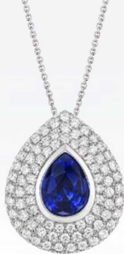
ROYAL BLUE SAPPHIRE