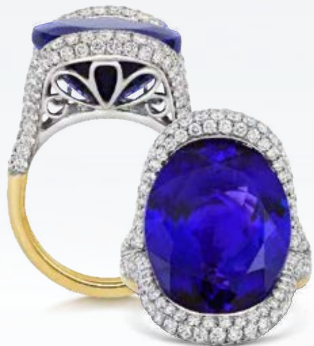
THE BLUE TULIP