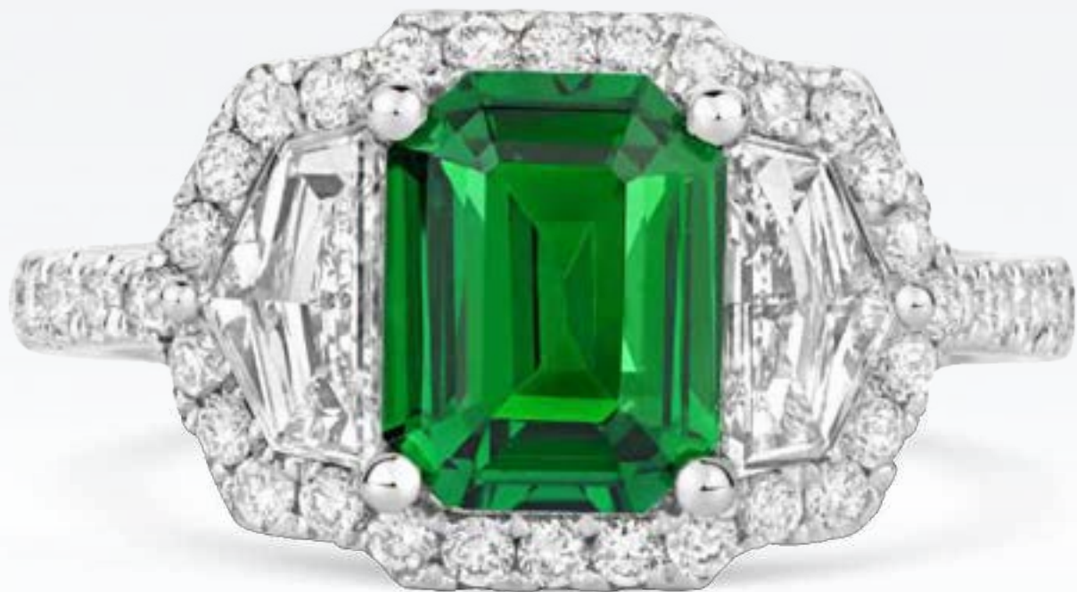
AFRICA'S FINEST - TZAVORITE GARNET